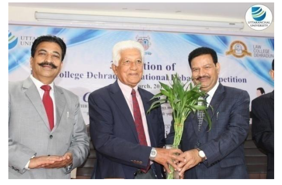
National Debate Competition: 3rd Edition of Concours De Debat, 2019