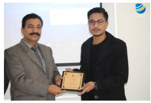
The third session of the training program was held in two mock sessions on 18^{th} and 19^{th} of February 2019. The sessions

The second session of "CONNAÎTRE 2019" was held on the 15<sup>th</sup> of February, 2019. It aimed to teach students about the Rules of Procedure followed in different committees, Research Methodology and documentation.